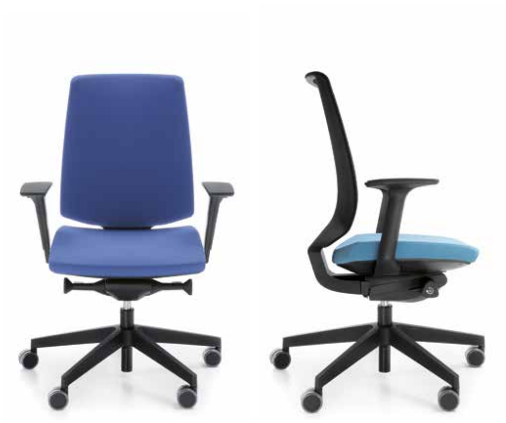
LIGHTUP 230SFL BLACK P61PU